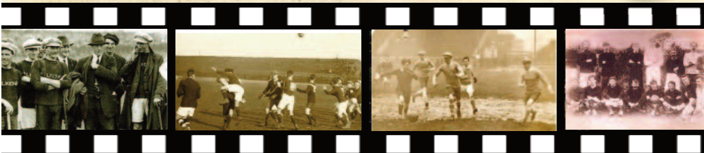
The above excerpts are taken from the official GAA website and compiled from a wide variety of sources. Accordingly the accuracy may be open to scrutiny