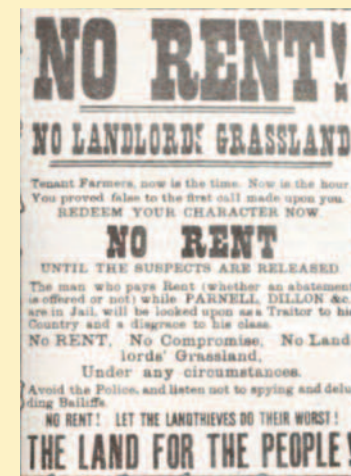
A Irish Land League Poster

Davitt died in Elphis Hospital, Dublin on 30 May 1906, aged 60, from blood poisoning. The Lord Lieutenant of Ireland attending the funeral was a public indication of the dramatic political journey this former Fenian prisoner had taken. Davitt's body was brought quietly to the Carmelite Friary, Clarendon Street, Dublin but the next day over 20,000 people filed past his coffin before his remains were taken by train to Foxford, County Mayo and buried in the grounds of the Abbey near where he was born, where his family suffered the humiliation of eviction and where his great agitation campaign began - Straide, County Mayo.